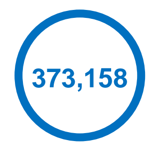
Highest Post reach