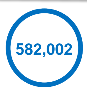
Likes on Facebook