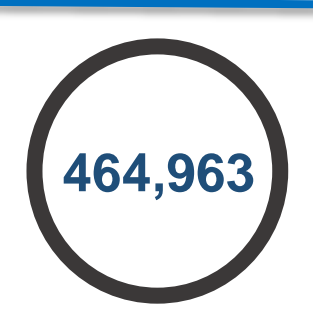
Likes on Facebook