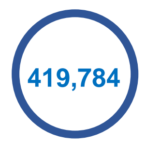
Post reach per week