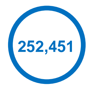
Highest Post reach