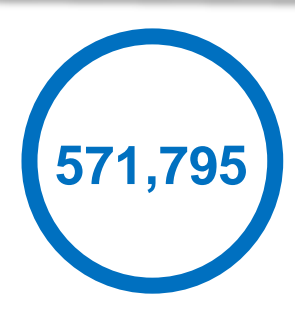
Likes on Facebook