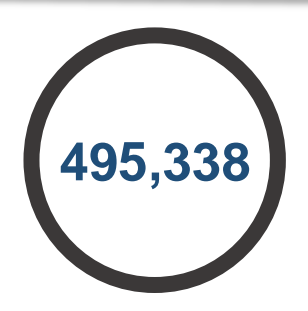
Likes on Facebook