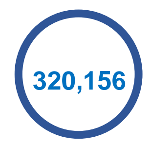
Post reach per week