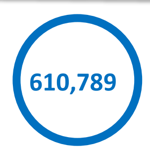
Likes on Facebook