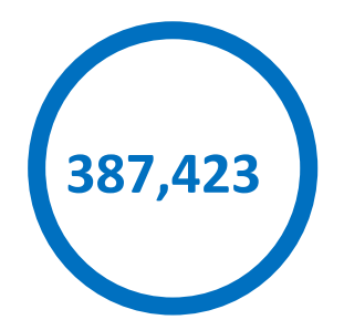
Highest Post reach