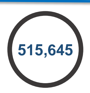
Likes on Facebook