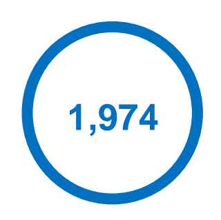
Number of Likes per week