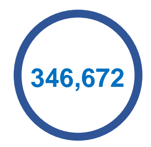
Post reach per week