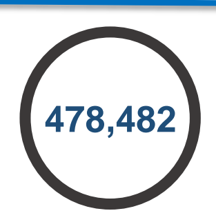
Likes on Facebook