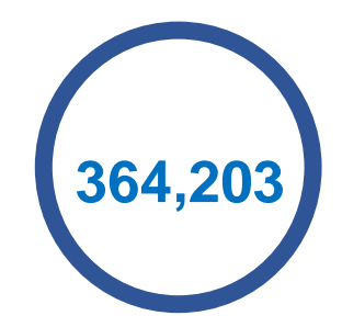
Post reach per week