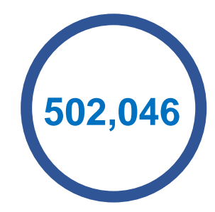
Post reach per week