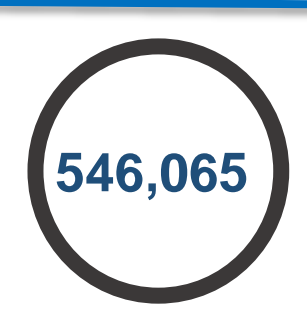
Likes on Facebook