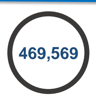
Likes on Facebook