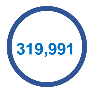
Post reach per week