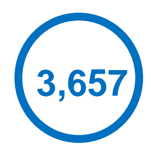
Number of Likes per week